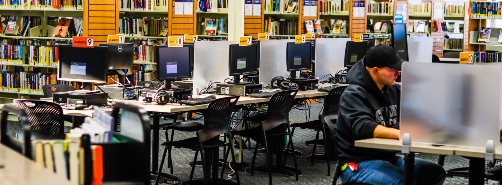
Computers by Library