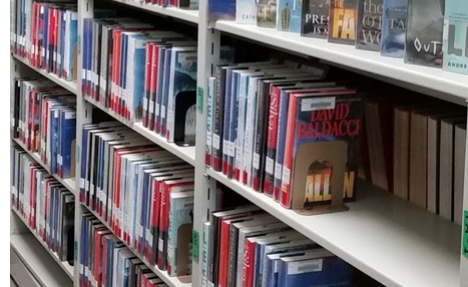
The first Lucky Day Collection processed for delivery!

Next to arrive will be Fear by Bob Woodward so check back with your local library as additional titles will randomly be added to the Lucky Day Collection!